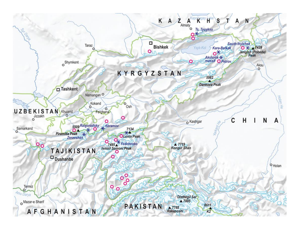
Figure 1: Glaciers of Central Asia

The number of glacial lakes and incidences of failure are expected to increase further as new lakes continue to develop and surrounding steep slopes destabilize in response to warming, particularly warmer summer temperatures. In Central Asia, regional scientific studies suggest that glacier shrinkage is causing more frequent hazards, including GLOFs (see Figure 1; Hoelzle et al., 2017). In addition to the large volume of water released by GLOFs, they present a significant transboundary hazard. Hence, the increasing risk of disasters from GLOFs is a significant threat to national and regional security and to sustainable development in Central Asia. In fact, during the international seminar co-organized by the UN Regional Centre for Preventive Diplomacy in Central Asia and UNESCO, "The Impact of Glaciers Melting in Central Asia on National and Trans-Boundary Water Systems" in Almaty, Kazakhstan, in April 2013, GLOFs were specifically highlighted as a key threat to the socio-economic development of the region. In June 2018, an international Climate and Water Forum held in Dushanbe, Tajikistan, reaffirmed the linkages between climate change, water resources, and disaster risk reduction in mountainous communities in Central Asia and highlighted the importance of partnerships between academia, hydromet agencies, ministries, and civil society in addressing threats.