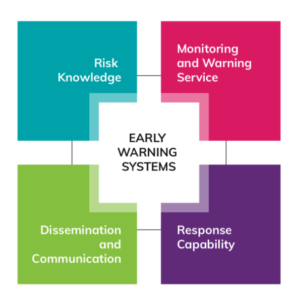
Figure 4: The four key elements of Early Warning Systems

As emphasized in the Sendai Framework, EWS are a key mechanism to achieve DRR and CCA, through reducing societal vulnerability. According to UN standards<sup>9</sup>, EWS comprise four inter-related elements as shown below, including detailed process understanding, communication aspects and capacity aspects, spanning far beyond the technical installations of measurement devices.